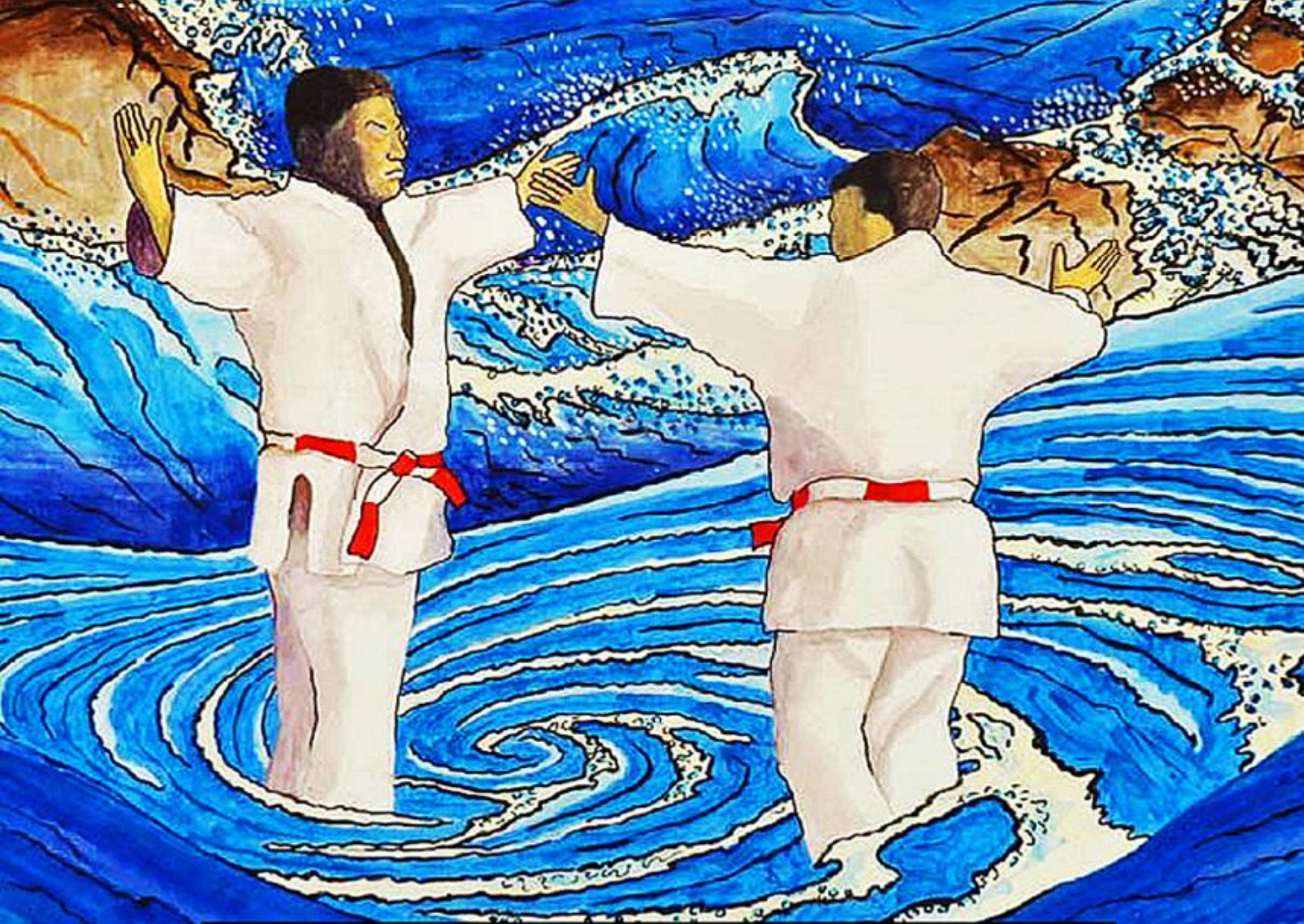
Sanbonme 三本目, the third technique from Itsutsunokata